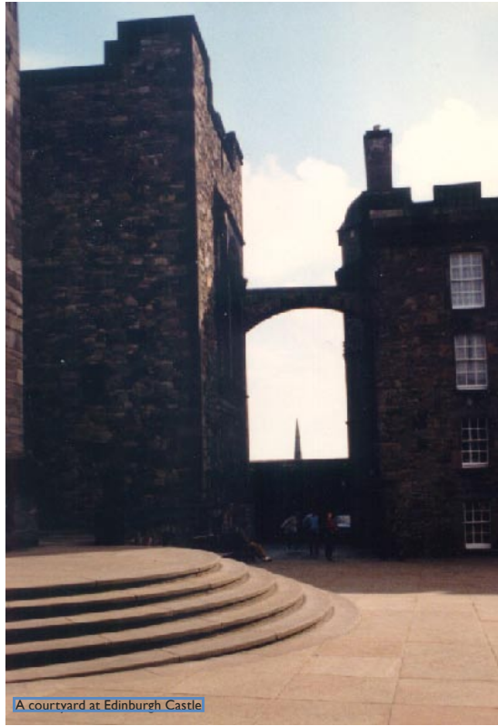
A courtyard at Edinburgh Castle

Two of Scotland's greatest ministers died some 250 years ago, yet the sermons, poems and other writings of Ebenezer and Ralph Erskine are still treasured and respected for their relevance to today's moral and spiritual issues. They were brothers in a large family as well as brothers in Christ, whom they served all their lives. Ebenezer, born in 1680, was five years old when Ralph was born. Brought up under the careful nurture and training of their father, a Covenanter minister, and their mother, both Ebenezer and Ralph were educated at the University of Edinburgh. Each served pastorates located in the narrow waistband of Scotland between the Firth of Clyde and the Firth of Forth.