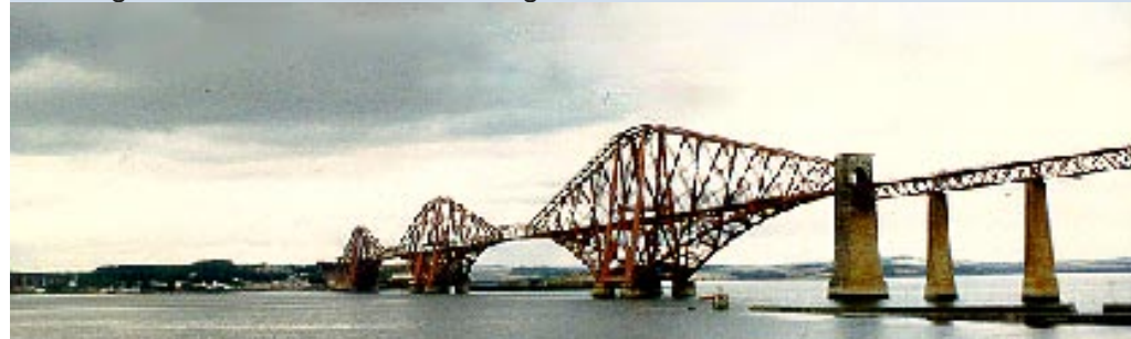
Old bridge over the Firth of Forth, Edinburgh, Scotland