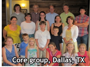
Core group, Dallas, TX

Catawba Presbytery has gone from no church plants to a burst of activity. This activity includes both South Carolina and Texas.